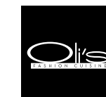
Oli's Fashion Cuisine