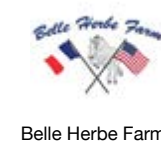
Belle Herbe Farm