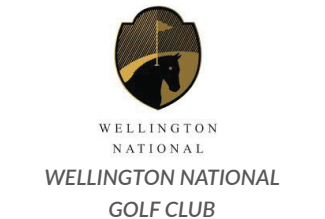
WELLINGTON NATIONAL GOLF CLUB