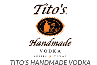
TITO'S HANDMADE VODKA