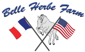
BELLE HERBE FARM