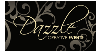
DAZZLE CREATIVE EVENTS