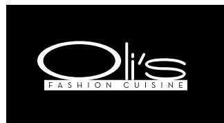
OLI'S FASHION CUISINE