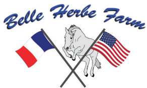
BELLE HERBE FARM